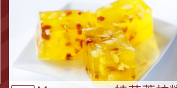
M 桂花荔枝糕 Lychee & Gogi Berry Jelly Dessert