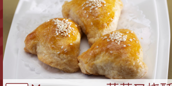
M 菠萝叉烧酥 BBQ Pork Pineapple Turnover Pastry