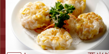
L 粟米饼 Golden Corn & Shrimp Dumpling