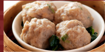
M 香葱陈皮牛肉球 Steamed Beef Meatball