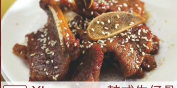
XL 韩式牛仔骨 Korean Style Beef Short Ribs