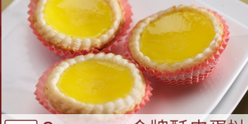
S 金牌酥皮蛋挞 Baked Egg Tart