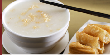
L 瑶柱白粥油条 Congee w/ Dry Scallop & Fried Dough