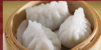
L 潮州粉果 Chiu Chow Dumpling (Pork & Peanuts)