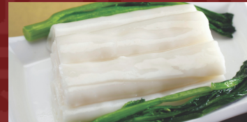
M 软滑齋肠粉 Plain Steamed Rice Crepe Roll