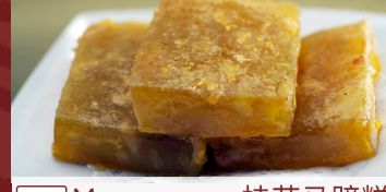
M 桂花马蹄糕 Pan Fried Water Chestnut Cake