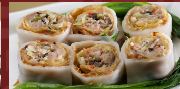
L 瑶柱葱花脆皮肠粉 Pork Stuffed Bean Curd Crepe Roll