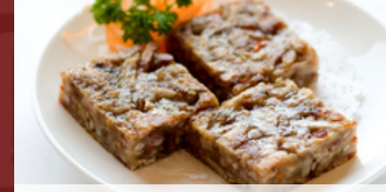
M 腊味芋丝饼 Taro w/ Chinese Sausage Cake