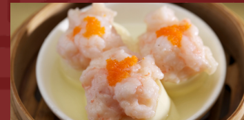
L 虾仁蒸玉子豆腐 Steamed Tofu with Shrimp