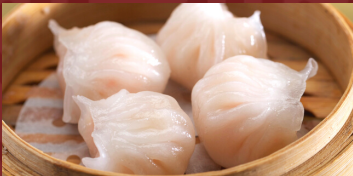
L 彩蝶虾饺皇 Imperial's Jumbo Shrimp Dumpling