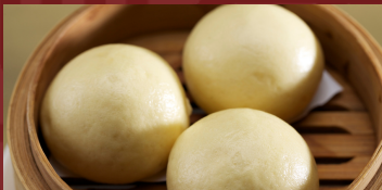
L 金牌流沙包 Steamed Creamy Lava Egg Yolk Bun