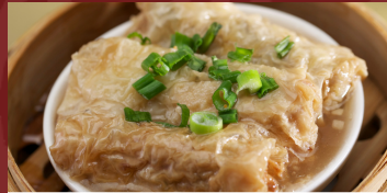
M 鲍汁鲜竹卷 Pork & Shrimp Stuffed Bean Curd Skin