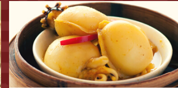
L 咖喱墨鱼仔 Baby Cuttlefish w/ Curry Sauce