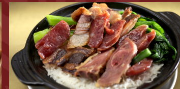
XL 腊味煲仔饭 Mixed Chinese Sausage w/ Rice