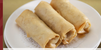
S 芋丝炸春卷 Crispy Taro & Chicken Spring Roll