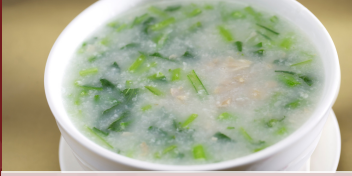
L 菜心咸鸡粥 Salted Chicken & Vegetable Congee