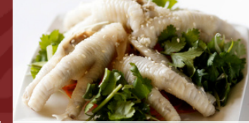
XL 白云凤爪 Bai Yun Chicken Feet