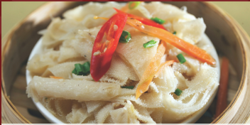
M 姜葱牛百叶 Beef Tripe w/ Ginger & Onion