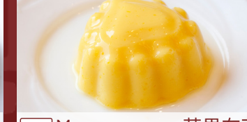
M 芒果布丁 Mango Pudding Dessert