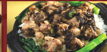
XL 榄菜排骨饭 Spare Ribs w/ Chinese Olives & Rice