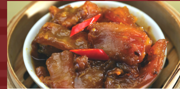
L 麻辣蒸牛筋 Beef Tendon with Mala Chili Sauce