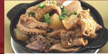
XL 牛杂猪肠粉 Braised Beef Tripe Stew w/ Rice Roll