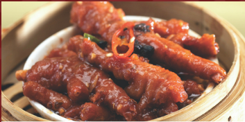
M 京酱蒸凤爪 Steamed Chicken Feet