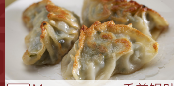
M 香煎锅贴 Pan Fried Pot Stickers