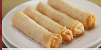
L 脆皮炸虾卷 Crispy Shrimp Roll