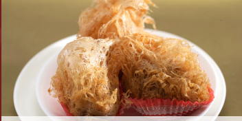
M 蜂巢芋角 Crispy Fried Taro Dumpling w/ Chicken