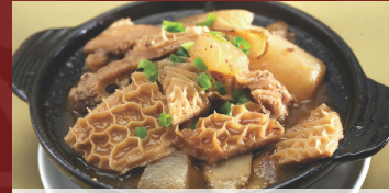
XL 萝卜牛杂 Braised Beef Tripe Stew