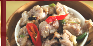
M 金瓜蒸排骨 Spare Ribs in Black Bean Sauce