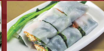
L 翡翠黄金肠粉 Tofu & Vegetable Rice Crepe Roll