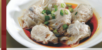
XL 红油抄手 Wonton Dumplings in Spicy Chili Oil