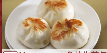
M 冬菜生煎包 Pan Fried Pork Buns w/ Preserved Veg