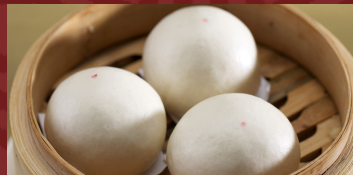
S 香滑奶黄包 Steamed Egg Custard Bun