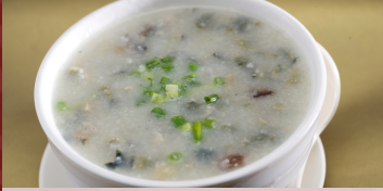
L 皮蛋瘦肉粥 Preserved Egg & Minced Pork Congee