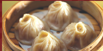
XL 蟹粉小籠包 Xiao Long Bao w/ Crab Meat