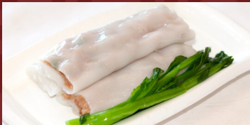
M 金菇牛肉肠粉 Beef & Enoki Rice Crepe Roll