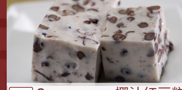
S 椰汁红豆糕 Red Bean & Coconut Cake Dessert