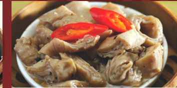
M 豉汁大肠 Pork Intestine w/ Black Bean Sauce