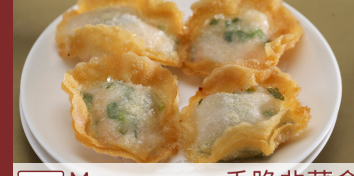
M 香脆韭菜盒 Crispy Shrimp & Chives Puffs