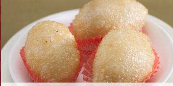
S 金珠咸水角 Fried Sticky Rice Dumpling w/ Chicken