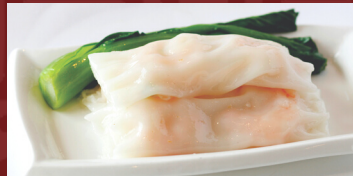
L 芹菜鲜虾肠粉 Shrimp w/ Celery Rice Crepe Roll