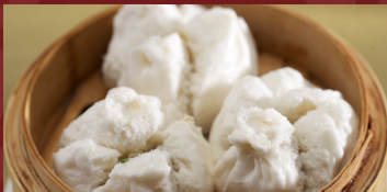
M 蠔皇叉烧包 Steamed BBQ Pork Bun