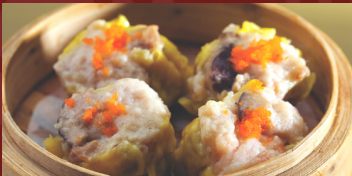
M 鱼子蒸烧麦 Siu Mai Pork & Shrimp Dumpling