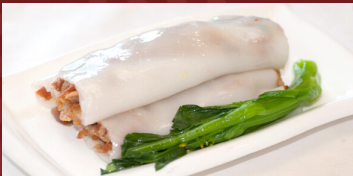
M 蜜汁叉烧肠粉 BBQ Pork Rice Crepe Roll