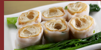
M 瑶柱炸两肠粉 Chinese Dough Rice Crepe Roll