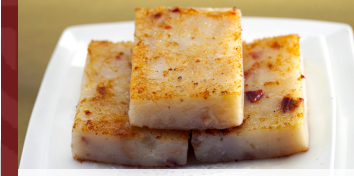
M 甘香煎萝卜糕 Pan Fried Turnip Cake