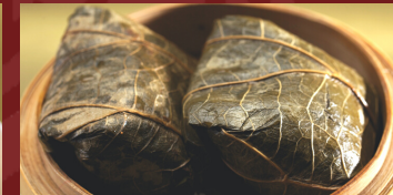
L 瑶柱珍珠鸡 Chicken Sticky Rice in Lotus Leaf