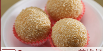
S 煎堆仔 Sesame Ball