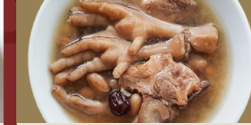
XL 藥膳凤爪 Herbal Chicken Feet