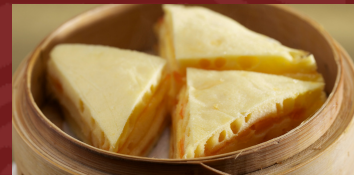
M 木瓜千层糕 Papaya & Custard Cake