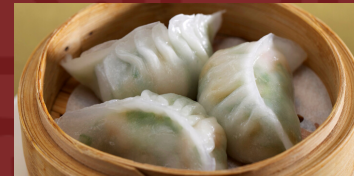
L 鲜虾韭菜饺 Shrimp & Green Chive Dumpling