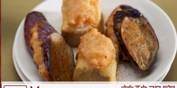
M 煎酿双寶 Eggplant & Tofu Stuffed w/ Shrimp